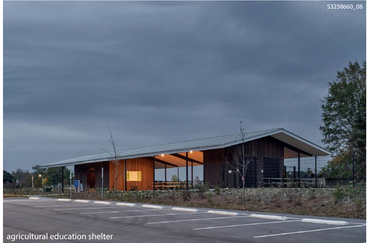
agricultural education shelter