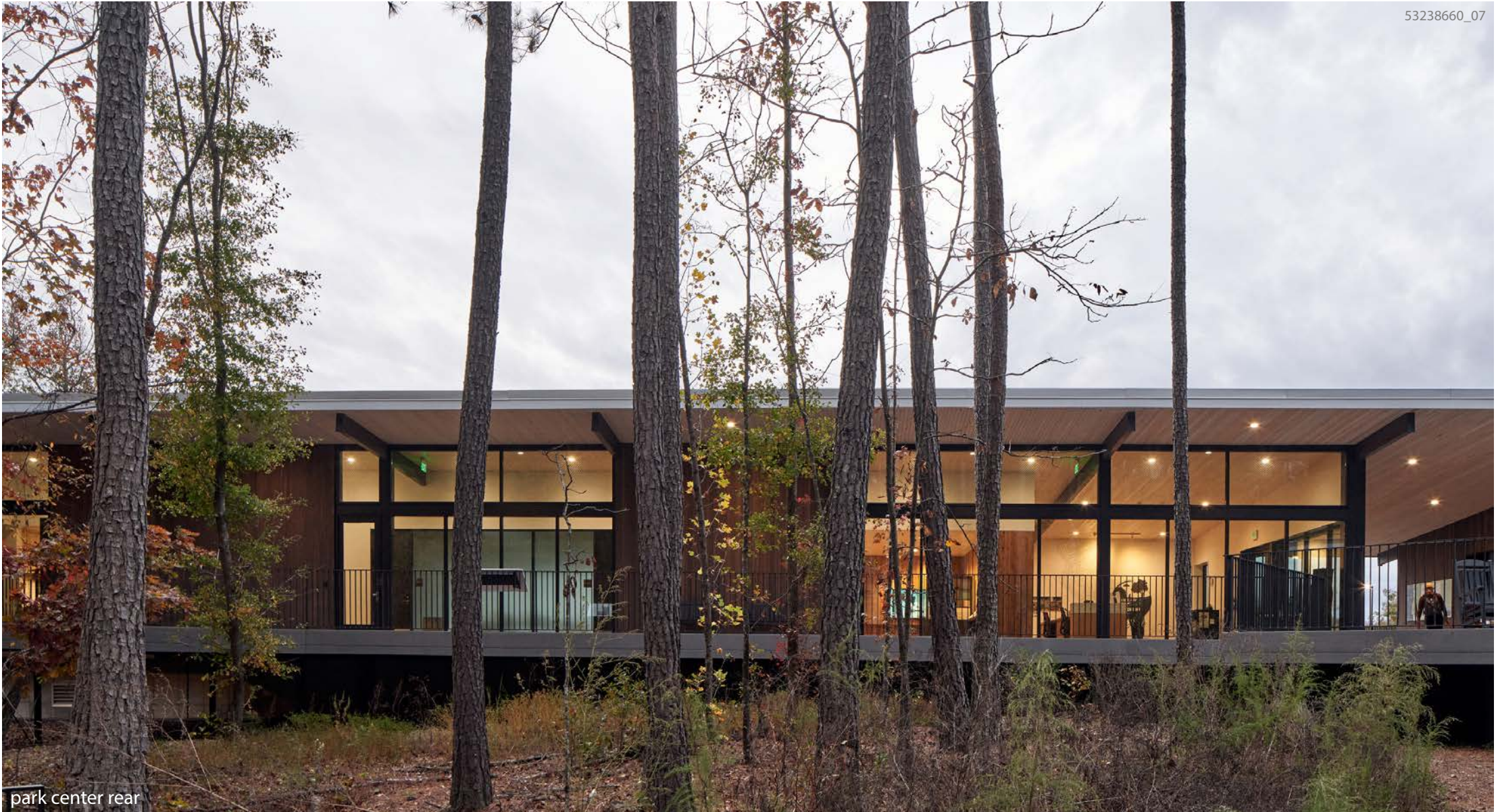
park center rear