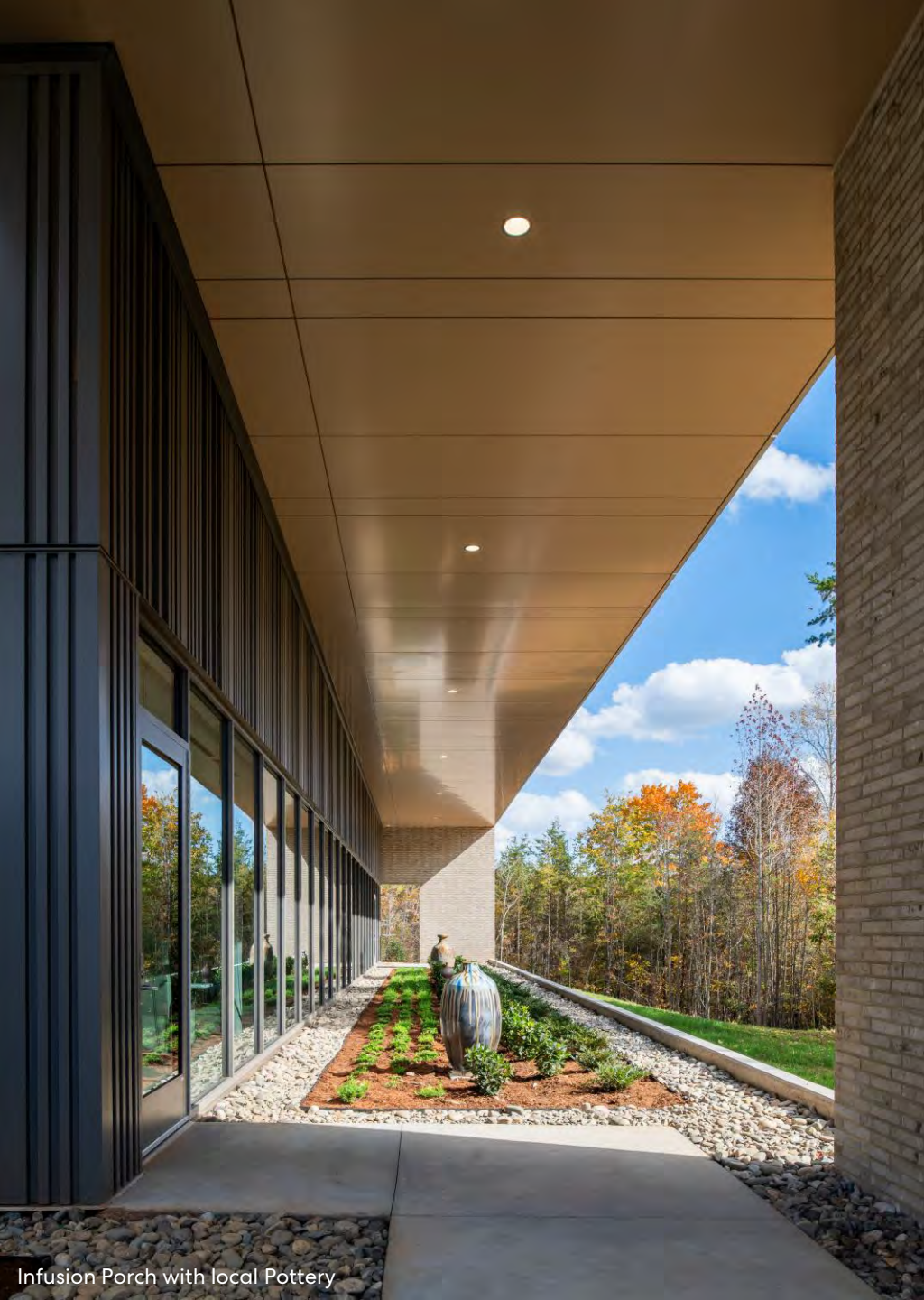
Infusion Porch with local Pottery