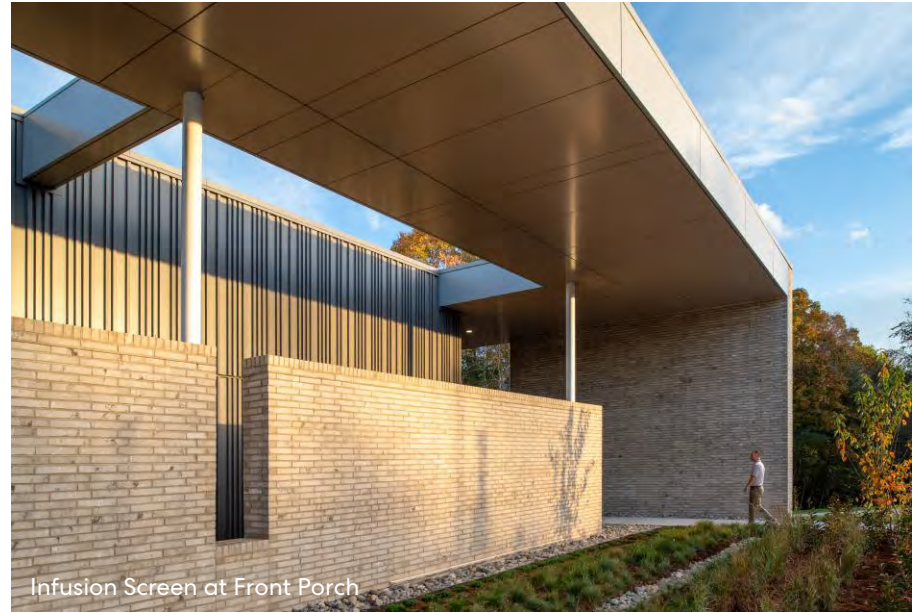
Infusion Screen at Front Porch