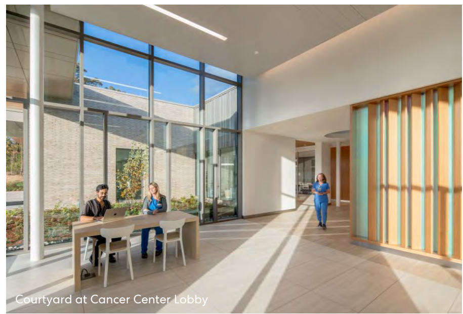
Courtyard at Cancer Center Lobby