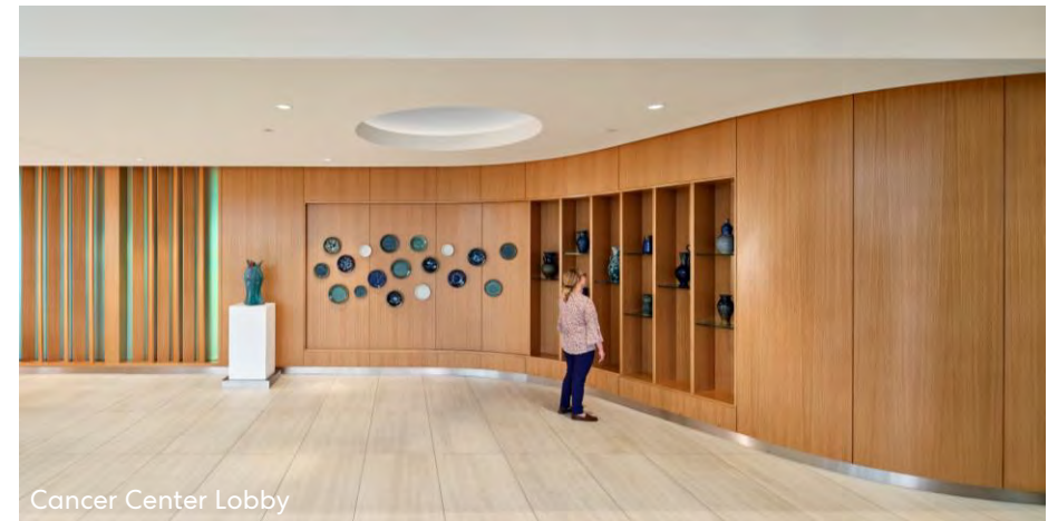
Cancer Center Lobby