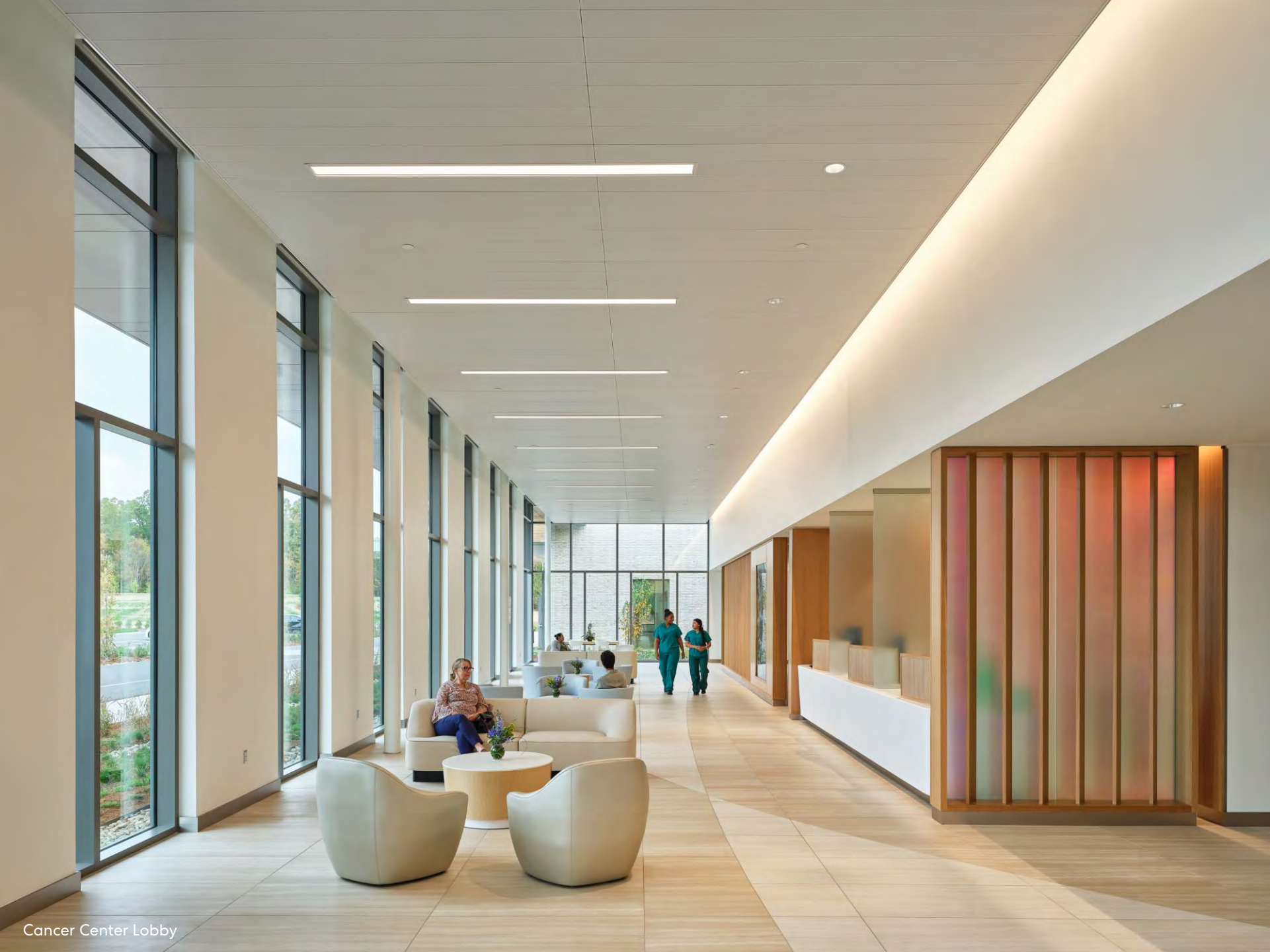
Cancer Center Lobby